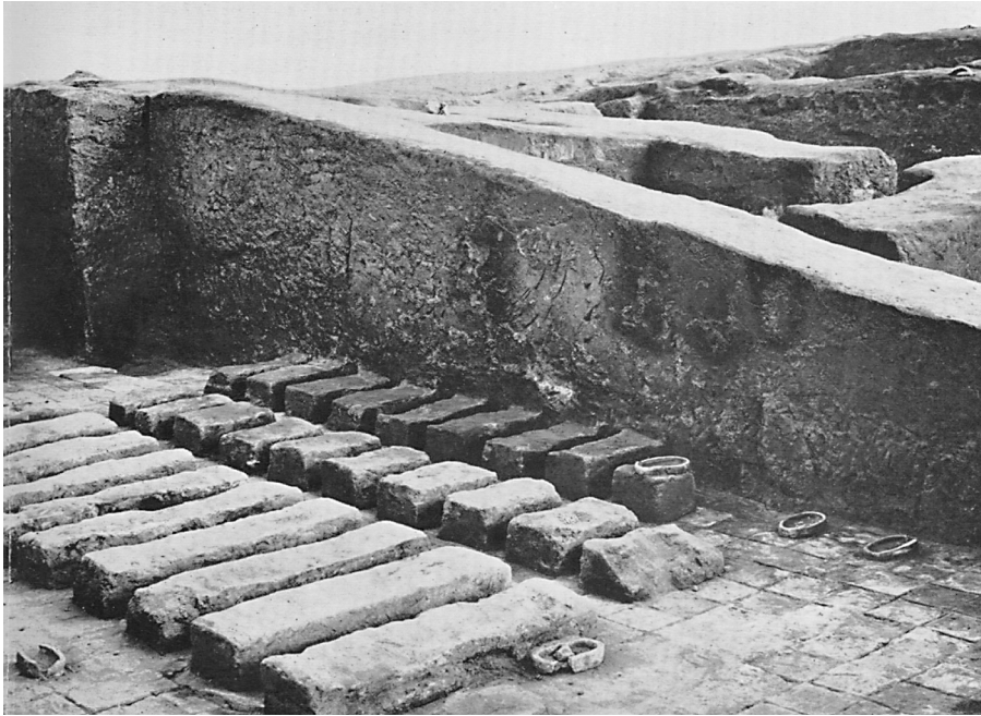
Fig. 1. Excavation of an early classroom from Sumer.

jects by inscriptions on tokens and the elaboration of the first writing system, cuneiform, which evolved slowly over time. Initially the system was used almost exclusively for record keeping but evolved to represent not only objects but the sounds of language, enabling letter writing and the recording of religious texts [Larsen 1986; Schmandt-Besserat, 1996].