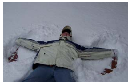
"This Is Just the Day"

now events are accounted for in an easy process that saves a lot of time in asking the specifics repeated times. These cards are passed around at every RHSA General Council meeting and give the member the chance to advertise their hall events. At the end of each meeting she collects and compiles them into a friendly email that help promote hall events. The UW RHSA experienced a