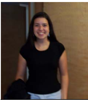
Always a bright smile!

Have you ever worked as hard as you knew how and people still didn't appreciate you? What do you do? You either give up or you keep on. - Mr. Rogers