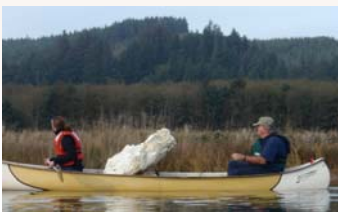
Outdoor Program Trip, p. 4

Even in its early stages the program has been a tremendous success. The Physical Plant estimates that the residence halls are recycling 7-10x more materials than they did last year. The Physical Plant is inundated with much more recycled material than they have ever had. So much so that they had to enlist the help of the Green Team for assistance in sorting the recyclables they are receiving. As we so often hear when successful programs bring about new challenges, the increase in recycling is a good problem to have.