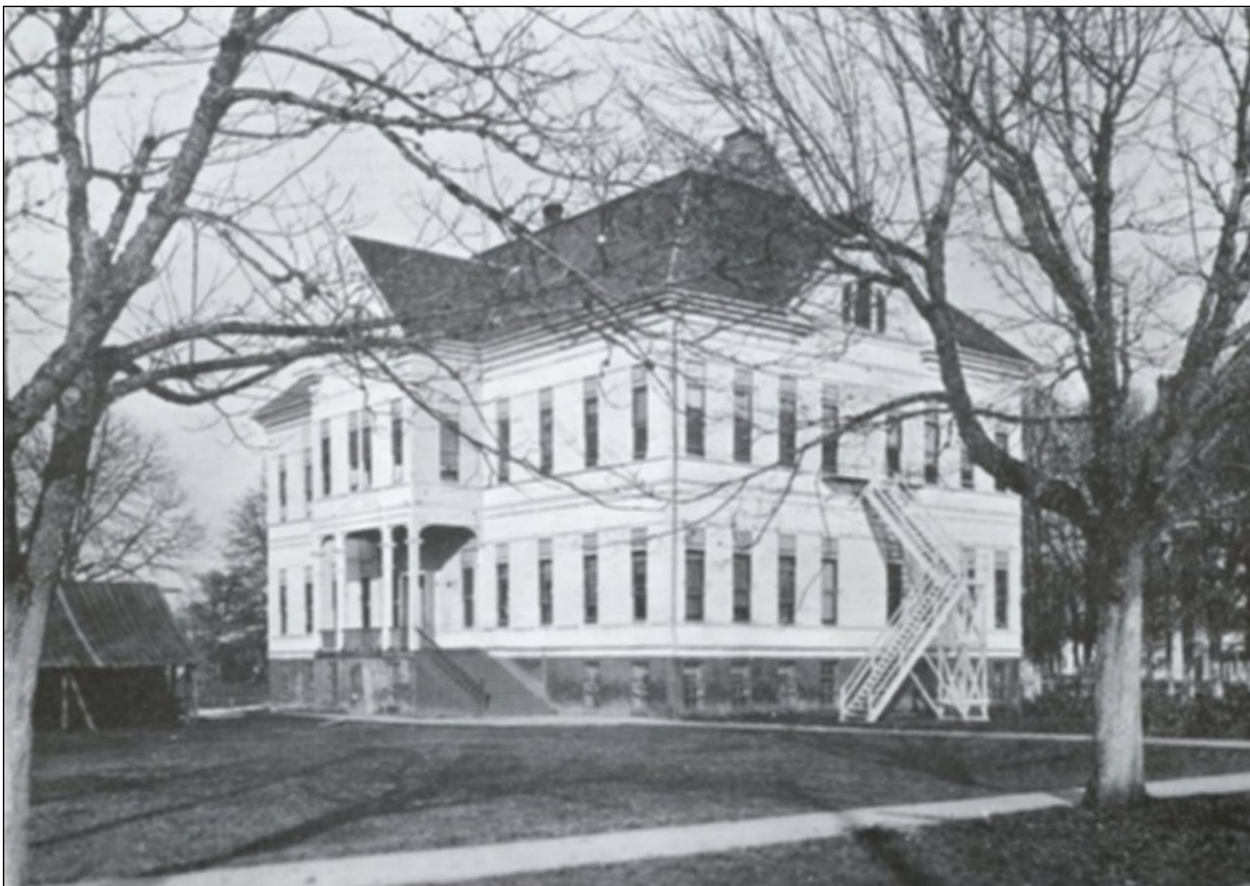
Independence Elementary and High School

Monmouth High School and Elementary (built in 1911 on the northeast corner of Knox and Powell) was used by Western Oregon University as a training school until 1915. At this time, the building presently known as the ITC was erected. The elementary students were moved to the new building, known at the time as the Campus Elementary, while the high schools students remained at the older building. In 1950, Monmouth and Independence school districts merged and the high school students were then relocated to Central High School with the grade school students remaining at the Campus Elementary. Independence, which agreed to become a training school in 1917, was dropped in 1957.