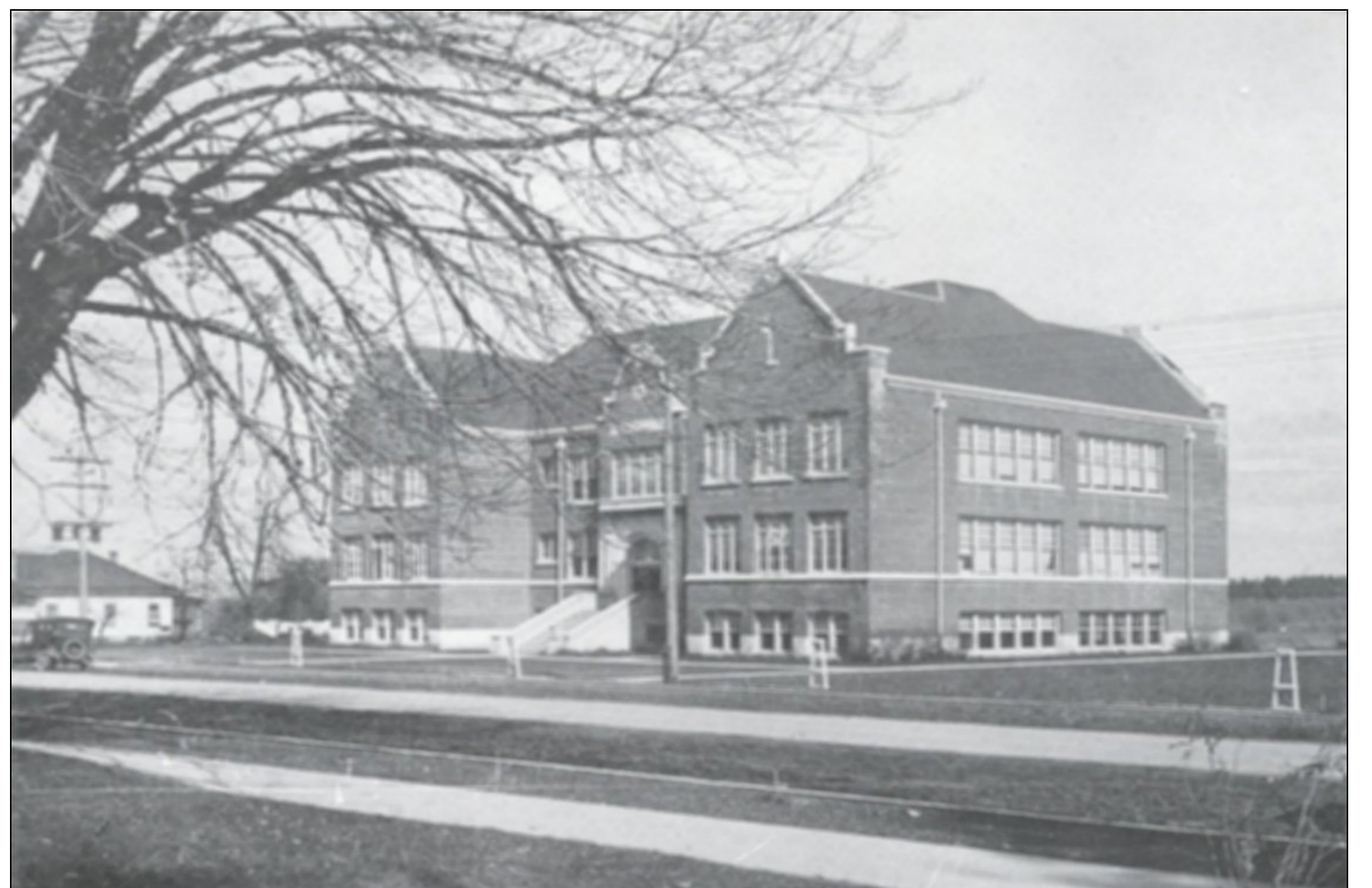
Campus Elementary, known today as the ITC building.