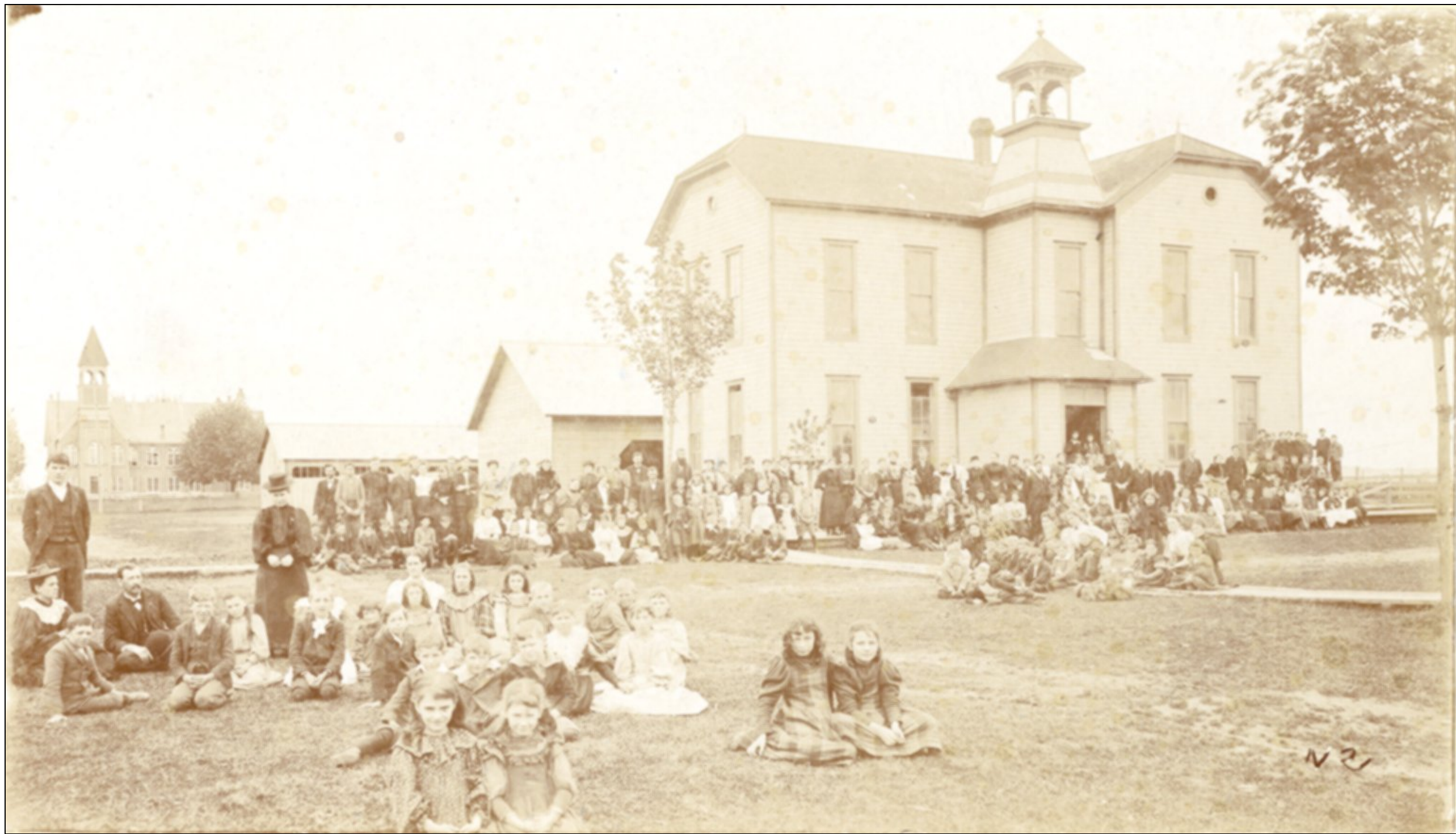
Photograph taken between 1896 and 1897 of the original training school located on the WOU campus. Campbell Hall, with the original bell tower, is located in the background.

Beginning in 1882, and continuing until today, Western Oregon University has held the distinction as Oregon's premier school for teacher education. While this has not changed for one hundred and fifty years, the way in which potential teachers are educated has.