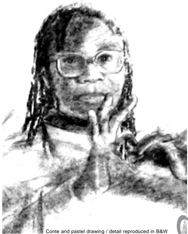
Conte and pastel drawing / detail reproduced in B&W by permission of the artist Suellen Newhouse Cupp