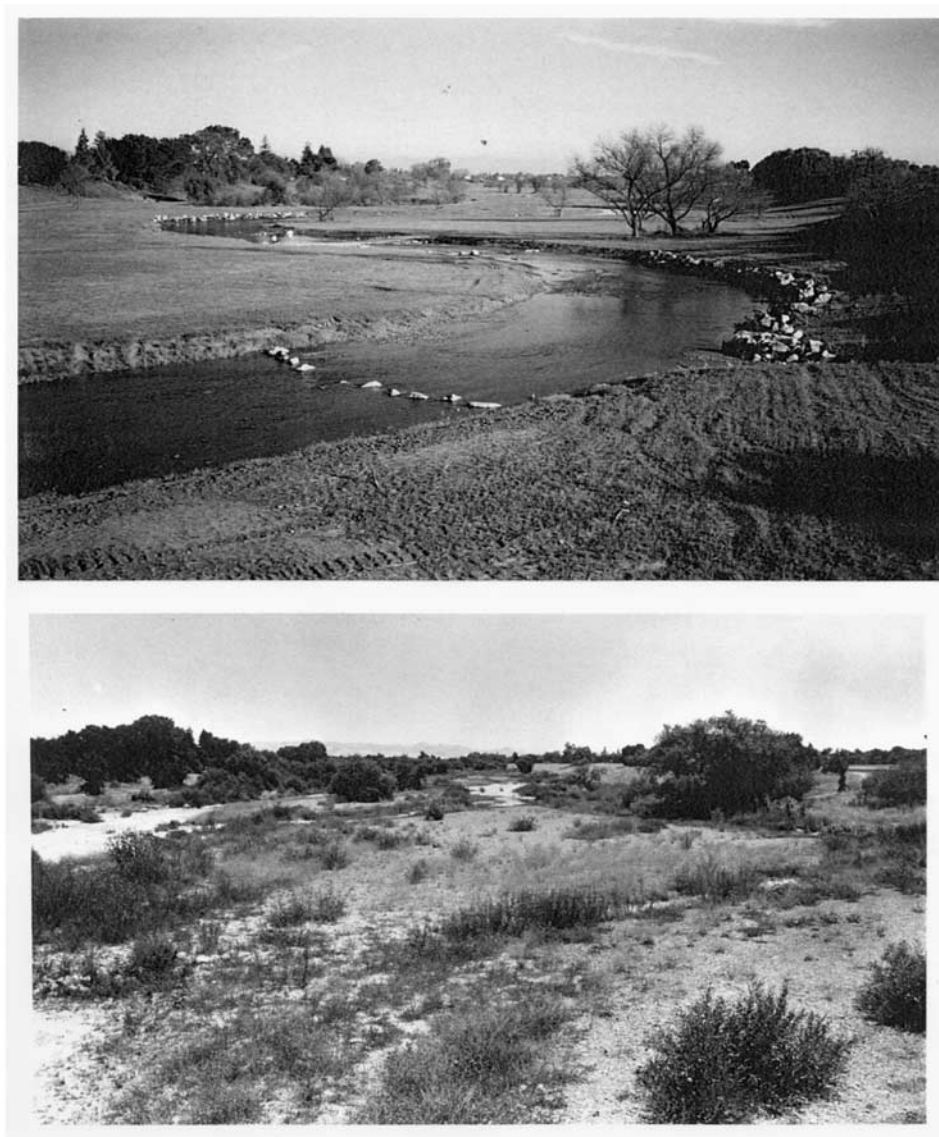
Figure 2. Photographs looking downstream along the channel of Uvas Creek in coastal California. (a) In January 1996, approximately 2 months after construction of a channel reconstruction project that emplaced a meandering channel form, and (b) in June 1997, after the project was destroyed during storm flows with a return period of 5–6 years. Historical geomorphological analysis indicated that the channel reach had been braided historically, typical of streams draining the Franciscan Formation in the California Coast Ranges, with episodic flows and high sand and gravel transport. (After Kondolf et al. [2001, Figure 5] with kind permission of Springer Science and Business Media.)

nels and floodplains [ Junk et al. , 1989; Bayley , 1991; Molles et al. , 1998]; patterns of downstream continuity or discontinuity in physical and biological parameters [ Vannote et al. , 1980; Fischer et al. , 1998; Poole , 2002; Benda et al. , 2004]; and vertical connections between the channel and underlying hyporheic zone [ Ward , 1989; Stanford and Ward , 1993].