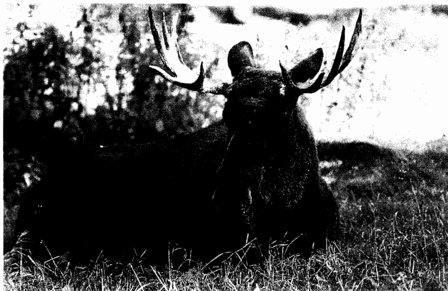
Figure 2. Moose

Geology is the most important factor controlling the source and distribution of radon. Relatively high levels of radon emissions are associated with particular types of bedrock and unconsolidated deposits, for example some, but not all, granites, phosphatic rocks, and shales rich in organic materials. The release of radon from rocks and soils