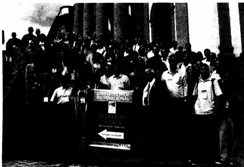
Figure 4. Participants at a Medical Geology workshop in Brazil. 2005