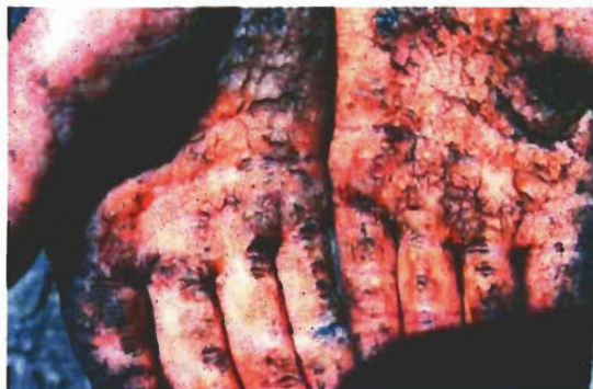
Figure 1 – Hyperkeretosis caused by exposure to arsenic mobilized by burning arsenic-rich coal in a residential environment in China.

We believe that the internet has played a major role in the resurgence of Medical Geology. The internet has provided the ability to instantly disseminate information throughout the world. Graphic color images, announcement of upcoming conferences and new books, publication of research reports, etc. are now within reach for every person concerned with these issues even in the most remote parts of the planet. These are commonly the places where these environmental health problems are most evident and most severe. An indication of the power of the internet and the rapid growth of Medical Geology can be gleaned from the number of Medical Geology 'hits.' As of January 1, 2006 'Medical Geology' produced more than 20,000 hits on the Google search engine and almost 12,000 hits on Yahoo, where just a few years ago the hits were measured in the hundreds.