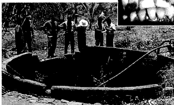
Dental danger. Geochemists studying the quality of water in a well in the dry zone of Sri Lanka. (Inset) Teeth from a patient with dental fluorosis in Sri Lanka.

From a strictly scientific perspective, one of the most interesting aspects of these studies is the biomineralogy of tooth enamel and the process by which hydroxyapatite, the