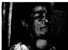
Woman with endemic goiter.

The most interesting feature in all these cases is that the people living in these HBRAs do not appear to suffer any adverse health effects as a result of their high exposures to radiation. On the contrary, in some cases the individuals living in these HBRAs appear to be even healthier and to live longer than those living in control areas that are not classified as HBRAs. These phenomena pose many intriguing questions for medical geologists.