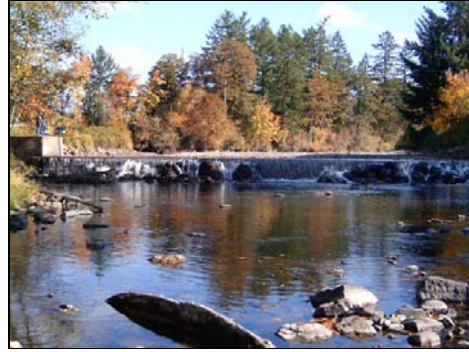
The Brownsville Dam was constructed as a hollow-core concrete dam.

The Brownsville Dam (Site) is located at river mile 38.8 of the Calapooia River adjacent to the south of Northern Drive, approximately 2.5 miles west of the City of Brownsville, Oregon (Sheet AB-1). The Site is located on tax lot 400, Donation Land Claim (DLC) 58. An approximate location description is the northwest quarter of the northeast quarter of Section 4, Township 14 south, Range 2 west of the Willamette Meridian, Linn County, Oregon. Based on the United States Geological Survey (USGS) 7.5 minute series topographic map of the area (Brownsville Quadrangle), the latitude is 44.3878 north and the longitude is -122.9301 west (USGS, 1988).