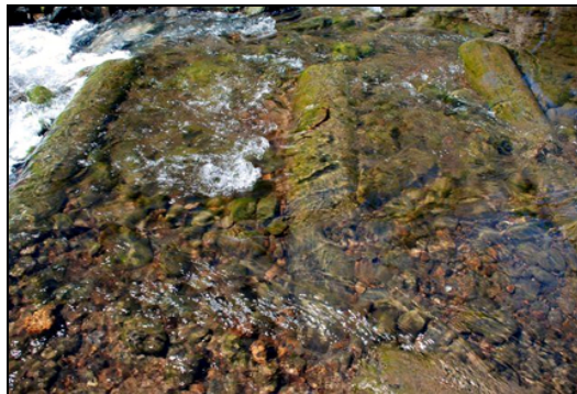
Large timbers with rebar and other wood remnants were encountered in the streambed and gravel bar.

During completion of the north-side notch in the dam and placement of the cement blocks, large timbers with rebar and other wood remnants were encountered in the streambed and gravel bar (Photograph 8). The CWC notified the SHPO of the remnants and requested information on their disposition. At the request of SHPO and CWC, CES photographed and mapped the remnants prior to continued work. As directed, remnants were left in place except where they directly hindered the completion of the dam removal. It was not determined whether the remnants were related to the original wood crib dam or to a later construction. A copy of the remnant location map is included in Appendix C.