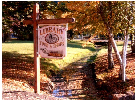
The Brownsville Dam was designed to divert water into the Brownsville Canal.

The clean-water bypass with a cofferdam consisted of using the existing Brownsville Canal, to which the dam was designed to divert water, as a bypass. The river water would be diverted into the canal upstream of the dam. A cofferdam would be placed around the dam to isolate it from any water that backflowed to the dam or seeped around the diversion. Dam removal could then take place without significant concern for a large sediment release. This alternative was not selected for the following reasons: