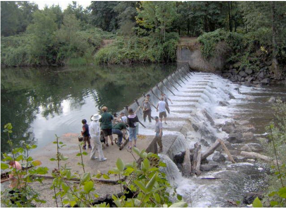
Brownsville Dam – August 18, 2007

Community members remove the flashboards for the final time. The flashboards raised the height of the dam by 5 feet to divert flow into the Brownsville Canal.