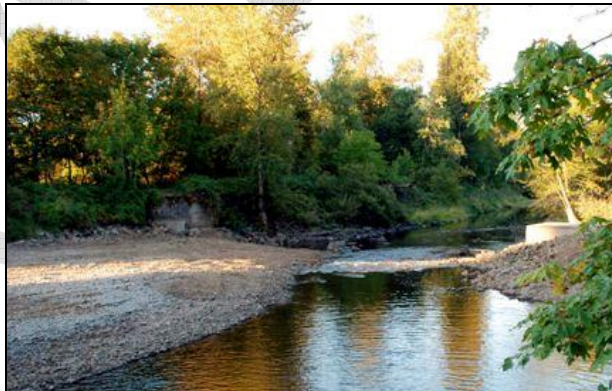
The Calapooia River channel was graded to match the existing contour of the gravel bar and the presumed center of flow of the river.

Site restoration began during the cleanup phase and was completed on September 8, 2007. Site restoration consisted of minor grading of the channel to approximate the presumed natural flow path of the river, placement of the large riprap, formerly in front of the dam, minor grading of the gravel bar, and restoration of the equipment access routes (Photographs 9-12). Specifically, the channel was graded to match the existing contour of the gravel bar and the presumed center of flow (thalweg) of the river upstream and downstream of the former dam.