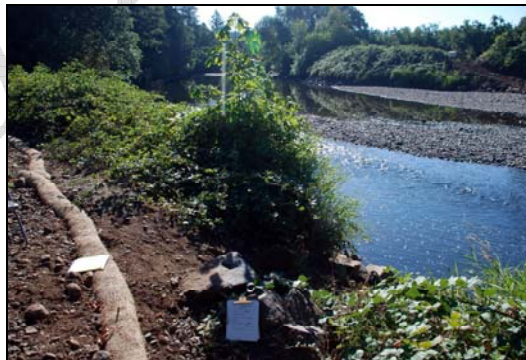
Erosion controls included straw waddles (above), silt fences, isolation dams, and a turbidity curtain.

As required by the Joint Permit, turbidity was monitored every four hours during active work. To maintain impartiality, monitoring was conducted at approximately 10 a.m. and 2 p.m. every day of active work. Monitoring began on August 27, 2007, and ended on September 7, 2007. In addition, a final reading was collected one week following cessation of active work to gauge background conditions. Monitoring was conducted with a LaMotte Model 2020 Turbidimeter. Readings were collected from a station 100 feet upstream (background) of the work area and 200 feet downstream (compliance) from water actively moving. A comparison was then made between the readings from the two points; a variation of more than 5 nephelometric turbidity units (NTU) would result in taking action to reduce turbidity. The comparison readings varied from a low of -0.24 NTUs to 4.12 NTUs. Turbidity never exceeded the lowest action level of 5 NTUs. The comparison reading was measured at 0.01 NTUs on September 14, 2007. A copy of the turbidity log is presented in Appendix C.