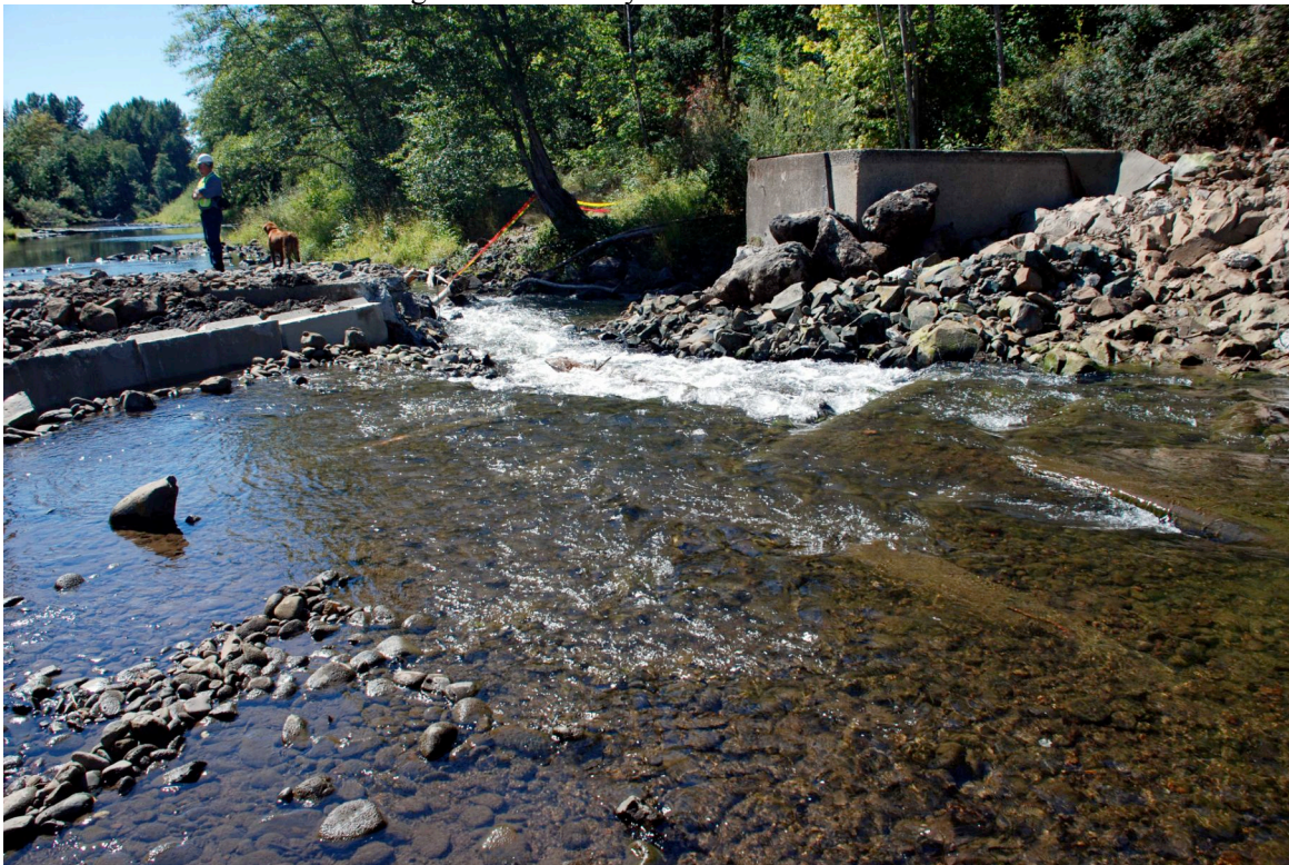
Brownsville Dam August 28, 2007 Day 2 of construction (Looking downstream)

Community members remove the flashboards for the final time. The flashboards raised the height of the dam by 5 feet to divert flow into the Brownsville Canal.