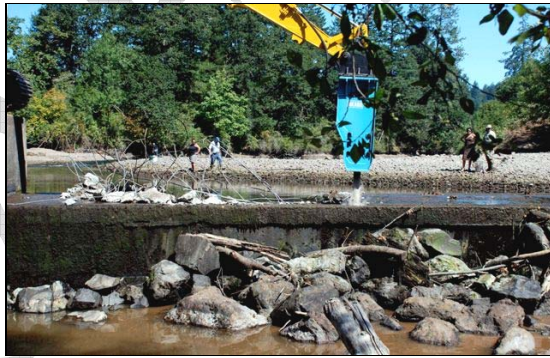
An excavator equipped with a jackhammer broke open the concrete.

Removal of the notch on the north side began mid-day on August 27, 2007. Personnel used an excavator equipped with a jackhammer and mounted on top of the north side abutment to break open the concrete (Photograph 5). Another excavator with a bucket and thumb was used to remove the broken pieces, rebar, and gravel fill. By the end of the first day, the notch was completed and water was flowing freely past the dam. Construction was completed on the north side around mid-day on August 28, 2007.