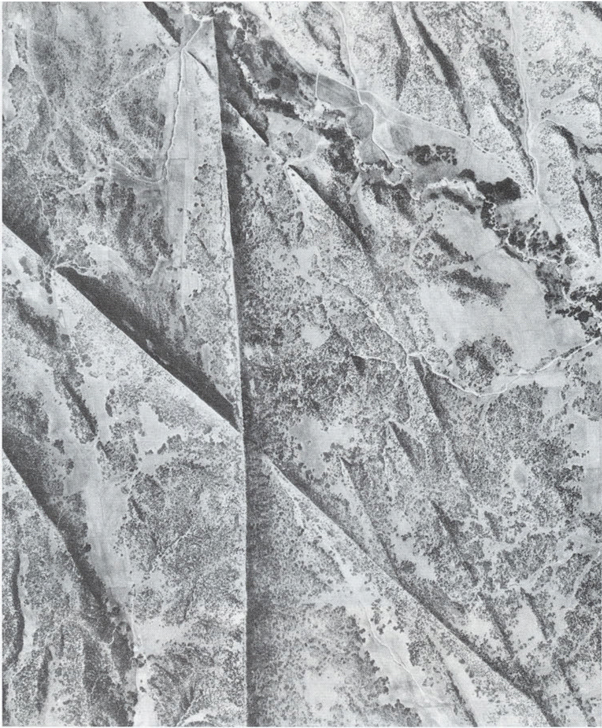
FIGURE 11-32 Intersecting dikes.