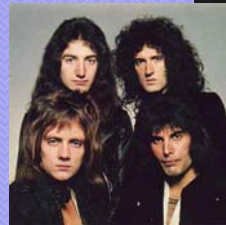
Freddie Mercury